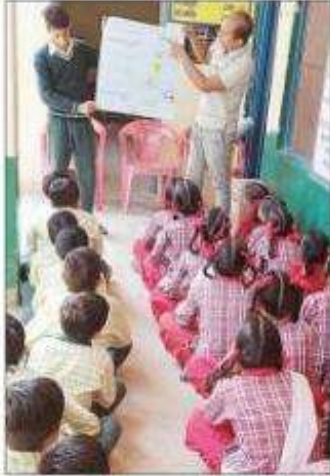
कुटाड़ : दांतों की स्वच्छता के बारे में जागरूक करते रुचि संस्था के प्रतिनिधि।

उन्होंने कहा कि संस्था की ओर से अभी तक लगभग 1800 स्कूलों छात्रों सहित स्वयं सहायता समूहों को सदस्यों